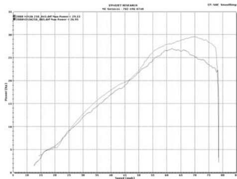
This graph shows a typical gain with a Dynojet jet kit.

For mildly tuned machines with the stock airbox removed and K&N filters installed. May also be used with a good aftermarket exhaust system. K&N filters # RU-1822